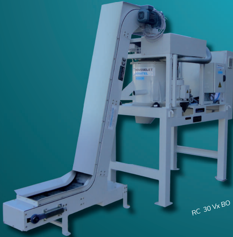
RC 30 Vx BO